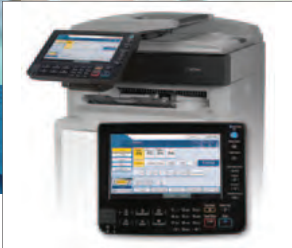
The adjustable full-color touch screen control panel on the SP 5210SF and SP 5210SR can be tilted to give users greater visibility and easy access to the 1-bin and finisher trays. It even offers animated guidance screens for step-by-step instructions.