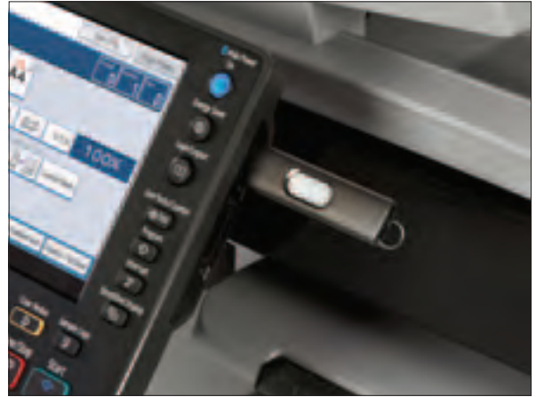
A USB Type A port is conveniently located in the control panel for quick and easy printing from/scanning to removable media.